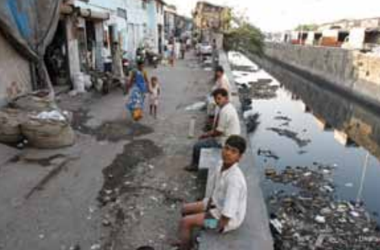
Residents sit outside a workshop in Dharavi, India.

purpose of the vent and the pipe is to enable oxygen to reach the lowest part of the furnace.